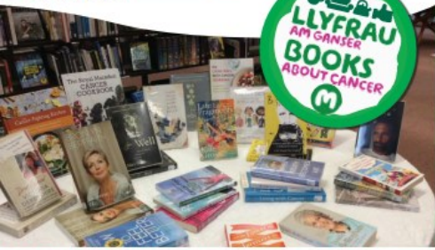
Rhaglen Gwella'r Daith Cancer ym Mhowys..... Improving the Cancer Journey in Powys programme