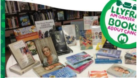
Rhaglen Gwella'r Daith Cancer ym Mhowys..... Improving the Cancer Journey in Powys pro