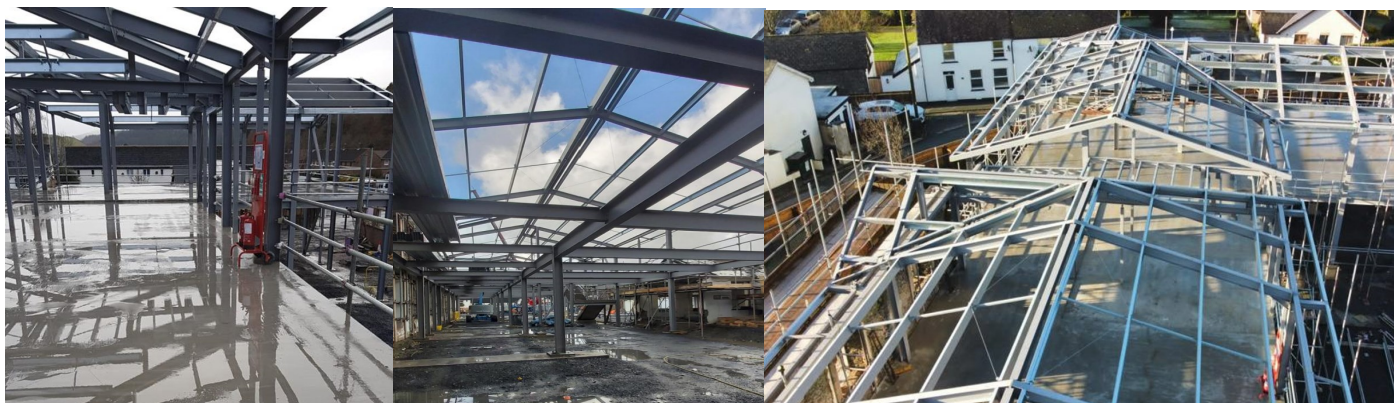
January Progress Photos - Steel Frame Erection