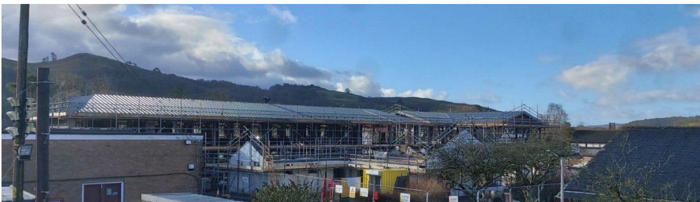
February Progress Photos - Front Block Roof