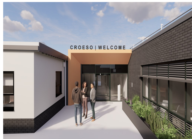
Design of the new front entrance with view to Café area

The new dining room which will become a patient, visitor and staff café will be to the right of the new entrance and will be an ideal place to sit and relax with a tea or coffee before your appointment or while you are waiting for a loved one to return from an appointment. The café will also be serving food for staff and visitors.