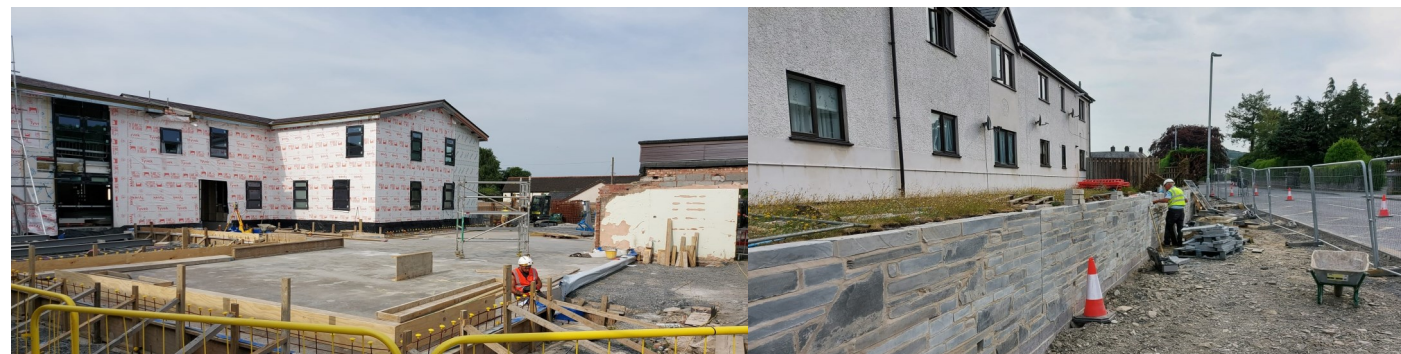
August Progress Photos

The café will provide a space for staff and visitors to the hospitals to use and enjoy. As we move forward from the peak of the Covid-19 pandemic we are excited to welcome visitors back to our hospitals.