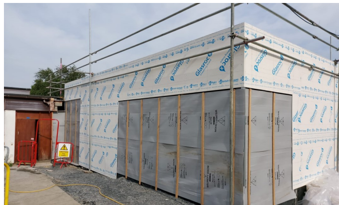
The new dining room under construction

Since the last newsletter the buildings are beginning to really take shape. The new dining room, pictured below will include glazed curtain walling situated where the grey sheeting is placed.