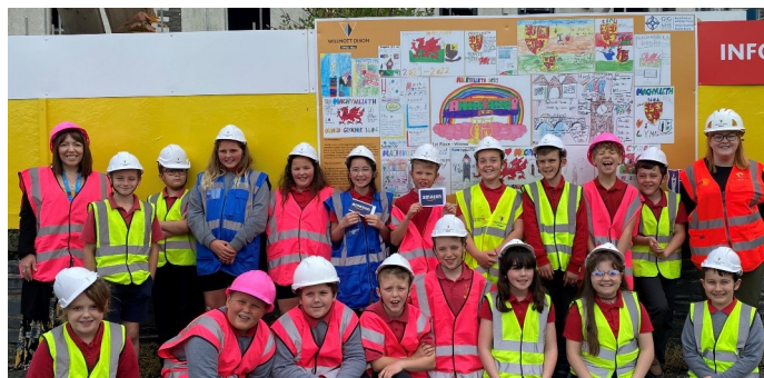
Unveiling our new hoarding designed by pupils of Ysgol Bro Hyddgen

The project brings wider community benefits and social value to the area such as employment, training and apprenticeship opportunities. Community benefits also includes involving the community in aspects of the reconfiguration.