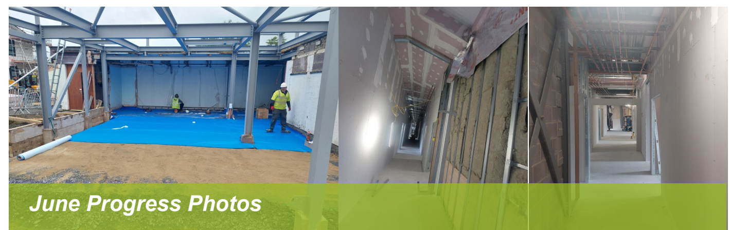
June Progress Photos