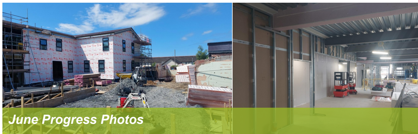
June Progress Photos