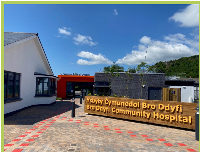
Bro Ddyfi Community Hospital Wayfinding and Main Entrance