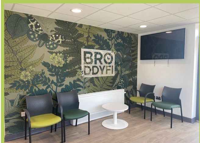
Adult Mental Health Waiting Area