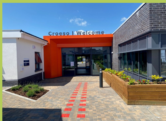
Bro Ddyfi Community Hospital Main Entrance