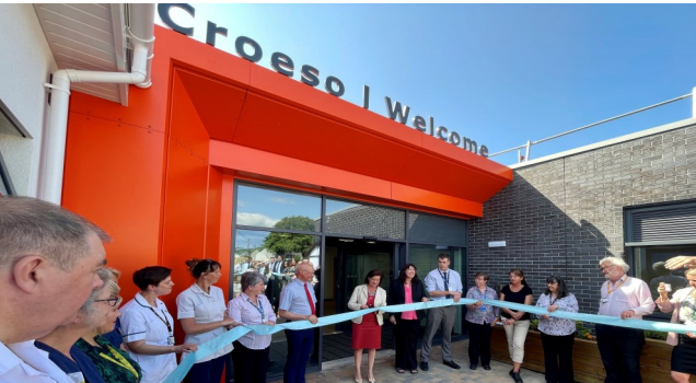
Eluned Morgan, Minister for Health and Social Services Officially Opening The Facility.