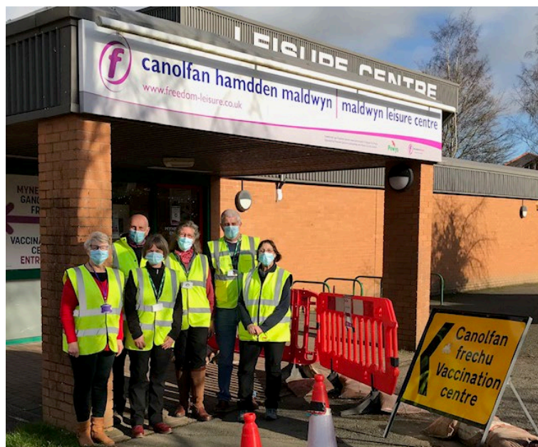
COVID-19 vaccination volunteers on our last day at Maldwyn Leisure Centre

Amidst these busy and challenging times, I was very touched that the Powys COVID-19 Vaccination Programme received the "Family of the Year" Award in the Powys County Times Community Heroes. It truly has felt like a big family, such an enormous team effort, to deliver such high levels of protection for our communities.