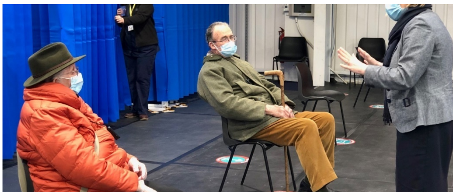
Vaccination under way at the Royal Welsh Showground

Wednesday this week saw the opening of the new Mass Vaccination Centre at the Royal Welsh Showground in Llanelwedd, Builth Wells. In its first few days of operation it will see almost 1,000 Powys residents aged 80 and over receive their first dose of the COVID vaccine.