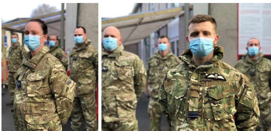
Members of the RAF team at Bronllys Hospital

We at Powys Teaching Health Board would like to express our thanks to the six members of the RAF who are supporting us with the roll out of COVID vaccinations.