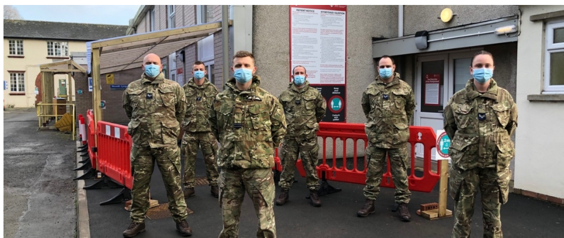
Support from our Armed Forces colleagues at Bronllys Hospital

Our third mass vaccination centre opened in Builth Wells this week, and arrangements are in place for the Newtown mass vaccination centre to relocate to its new location at Maldwyn Leisure Centre next week. Thank you to the Royal Welsh Agricultural Society and to Freedom Leisure for their support.