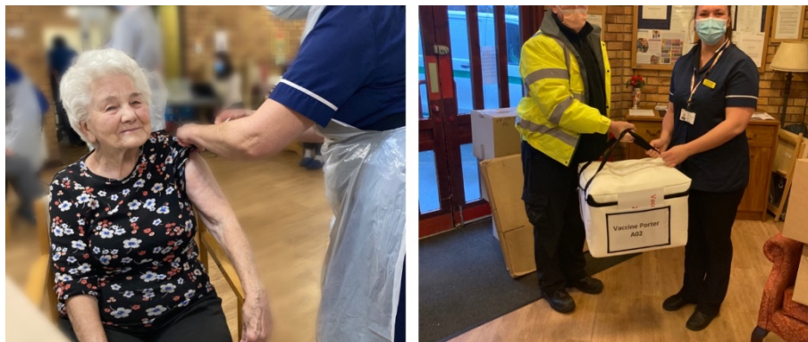
The Immunisation Team visits Plas Cae Crwn in Newtown

Just two weeks into January we have provided vaccination for nearly every resident of a care home for older adults in Powys.