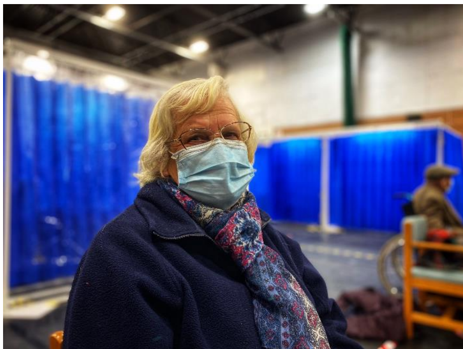
Our vaccination centre in Newtown moved to its new location in Newtown

With the county being battered by Storm Christoph, this total has only been made possible because of the amazing response of the people of Powys. With some people unable to attend their appointment due to flooding or icy conditions, we were quickly able to fill our slots thanks to local residents aged 70+ coming forward to visit our vaccination centres at short notice.